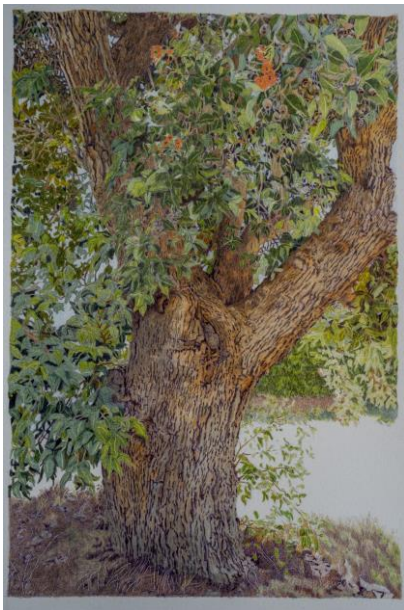
lowering Gum, coloured pencil, Carol Cowles

Our last meeting for 2022 was on 17 th December when the BAG enjoyed a festive lunch together.